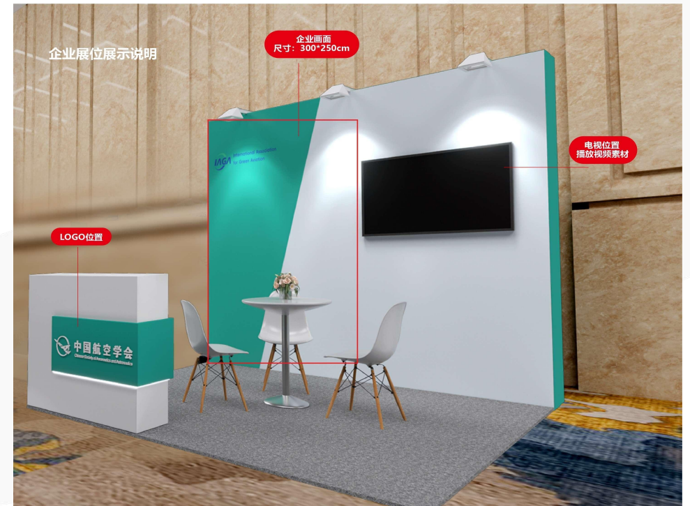
展位说明效果图 Rendering of Booth Design