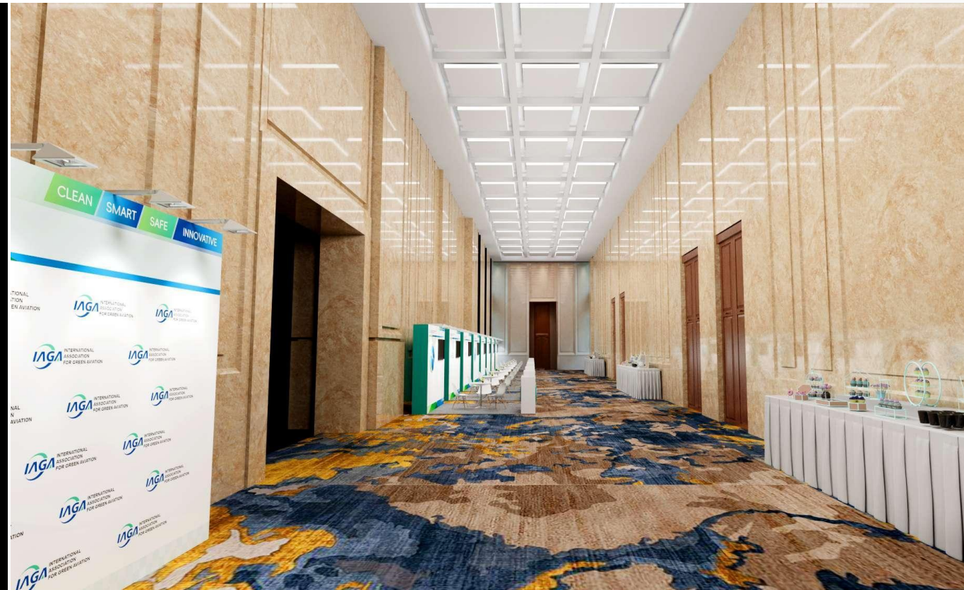
序厅搭建效果图 Rendering of the Lobby Construction